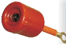
Part Number: R-1VH /R-1VL