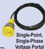
Single-Point, Single-Phase Voltage Portal