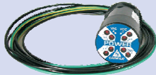
Part Number: R-3W2