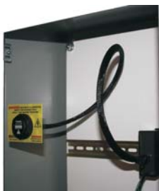
Part Number: R-3F with label (label sold separately)

The SafeSide® R-3F optical cable voltage indicator is a permanent electrical safety device (PESD) built to keep workers on the safe side of electrical panels by providing them with a no-voltage-at-the-door option when it comes to thru-door electrical safety. Global electrical designs specify panel-mount devices that operate at low voltage levels; the R-3F provides voltage indication with zero voltage on the outside of the panel.