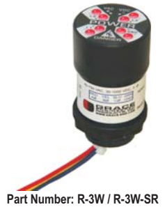
Part Number: R-3W / R-3W-SR