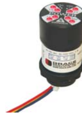
Part Number: R-3W / R-3W-SR

Part numbers include: R-3W, R-3W2, R-3W-SR, R-3F, R-1VH003 and R-1VL003