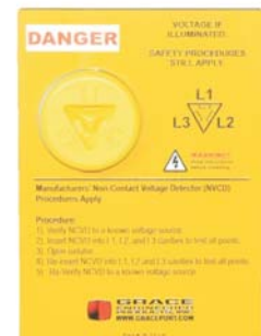
R-T3 voltage portal with label (sold separately)