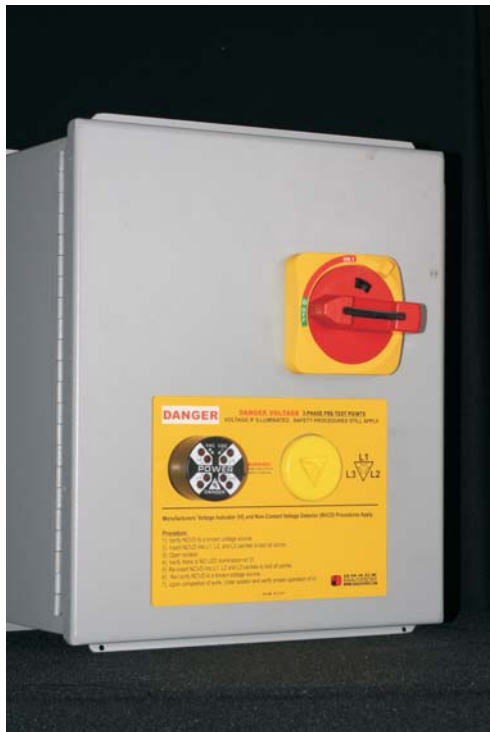
Part Number: R-T3W-LCH

Permanent Electrical Safety Devices (PESDs) are defined as external devices (except Medium Voltage Indicators, which are internal) permanently mounted to electrical systems that, directly or indirectly, reduce the risk of arc flash and/or shock hazard. They provide feedback on the voltage state within the enclosure and eliminate proximate exposure to that same voltage. Some examples of PESDs include voltage portals and voltage indicators.