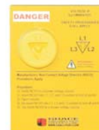
Part Number: R-T3 with label (label sold separately)

Part numbers include: R-1A003-LPH and R-T3