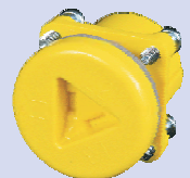
Single-Point, Three-Phase Voltage Portal